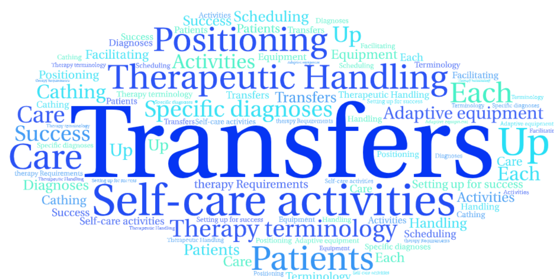
Figure 1. Survey responses to question on most beneficial interprofessional rehabilitation education topics.